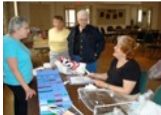
members who supported Helping Hands during the summer.