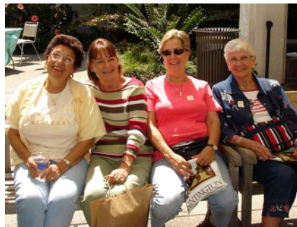
TWC members enjoying the Huntington Library.