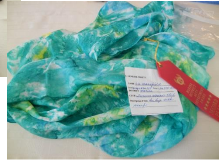
GiGi Mansfield - 2nd Place