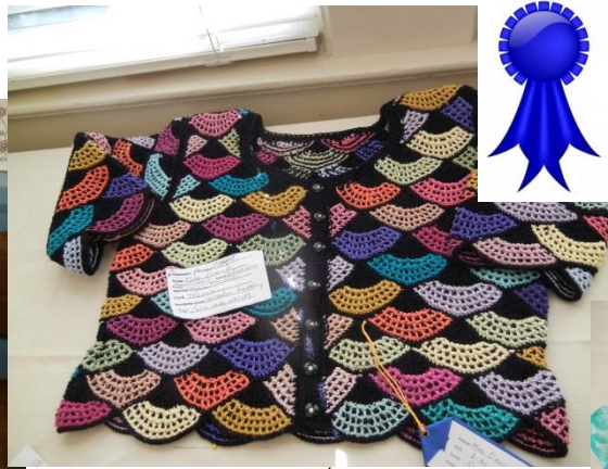
Mae O'Reilly 1 st Place