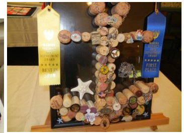
Best in Show